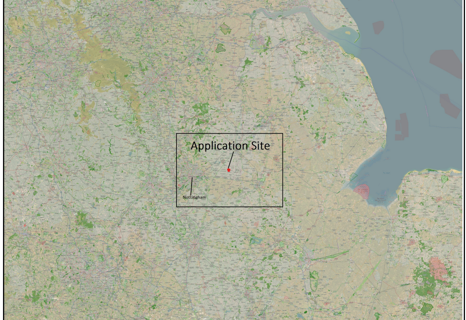
Date: 15/09/2022 Drawn By: Louis Maloney Scale (A3): 1:17,500 Drawing No: NEO000782/009I/B