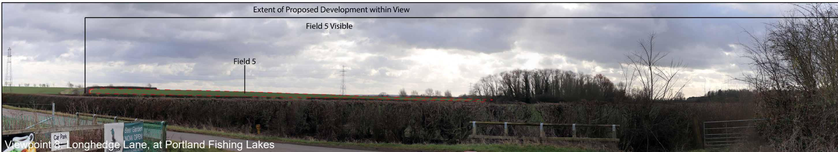
Viewpoint 8: Longhedge Lane, at Portland Fishing Lakes